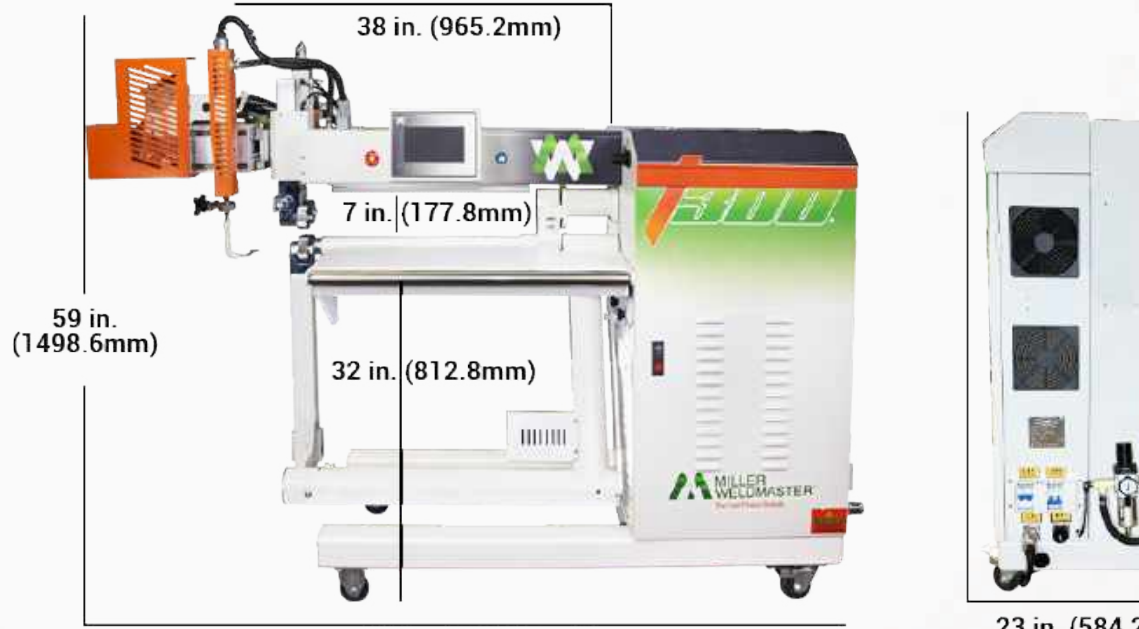
78 in. (1981.2mm)